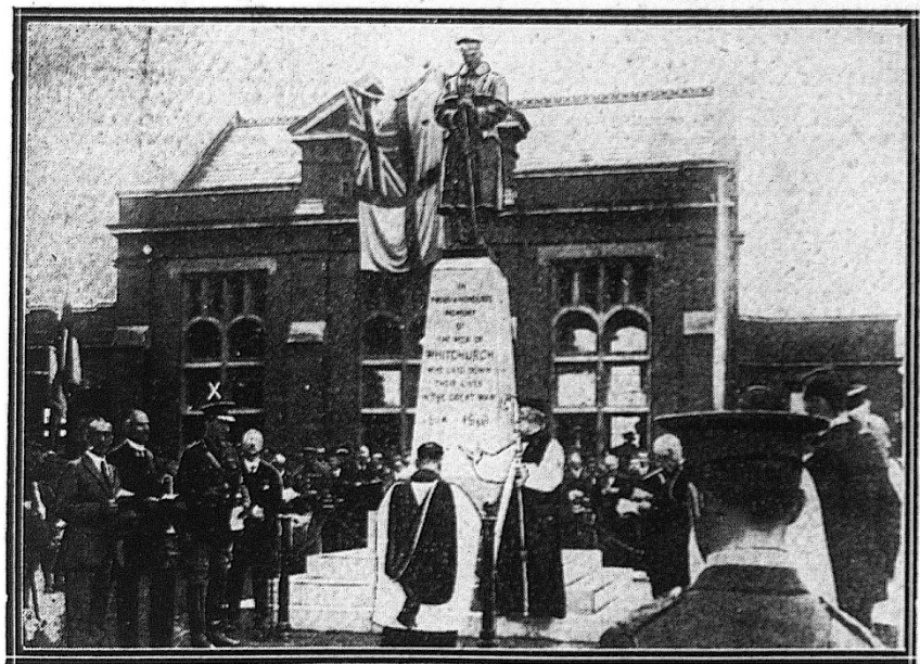
The Bishop of Llandaff is here seen dedicating the memorial to the men of Whitechurch who fell in the Great War, which was yesterday unveiled by the Earl of Plymouth (X).